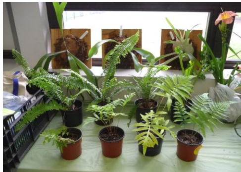
Great raffle selection