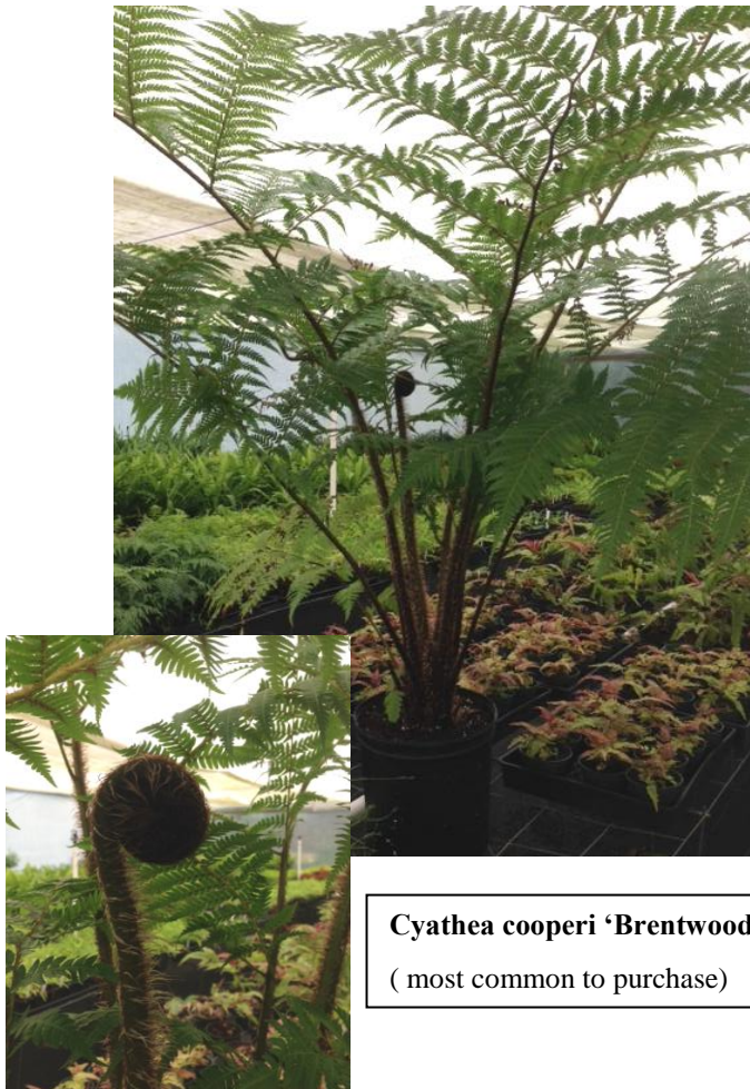
Cyathea cooperi 'Brentwood' ( most common to purchase)